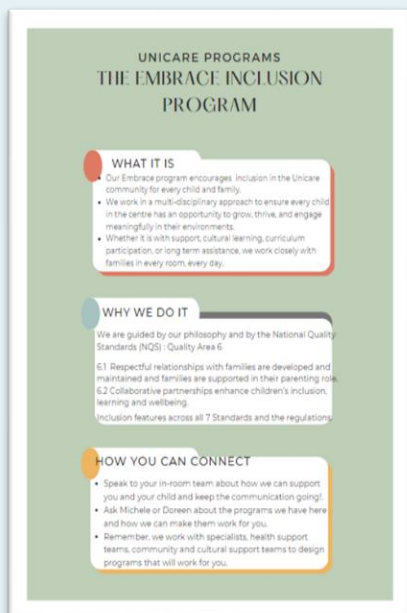
Look for the infographic in the Centre